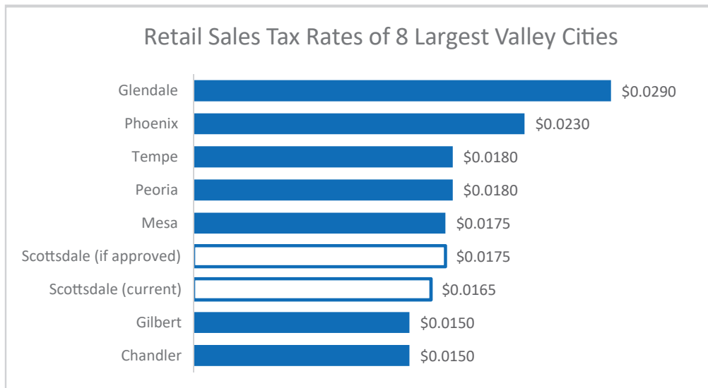
Source: ADOR TPT Tax Rate Table - June 2018 (via https://azdor.gov/transaction-privilege-tax/tax-rate-table )