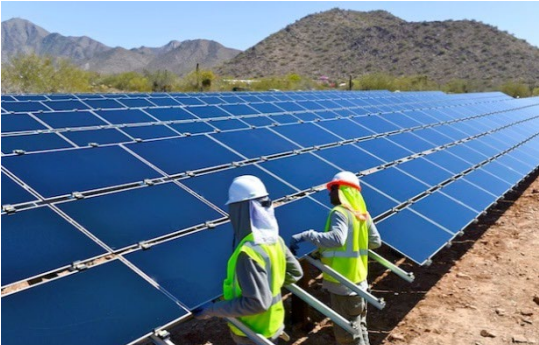
Ground mounted solar PV system.