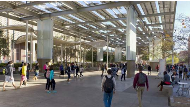
Pedestrian solar PV shade canopy.