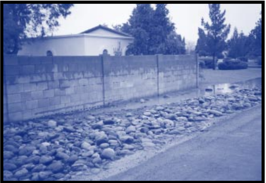
Undersized wall openings clogged easily, and caused the flooding in the photo on the cover.

The following guidelines are written in accordance with the City's Floodplain and Stormwater Ordinance. The guidelines are general in nature and may not fit all situations. If you have an unusual problem or have a specific question please contact the City's Stormwater Management staff at 480-312-7696.