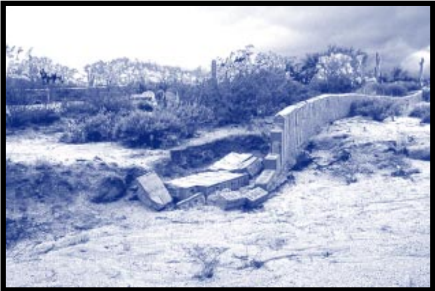
Inadequately sized wall opening.

If possible, avoid or replace weep holes or decorative block drains with a clear opening per City standard details. Weep holes and decorative block openings are generally so small they easily catch debris and clog, causing water to pond or divert (see photo p.1). This can result in backyard, pools, and houses being flooded and walls being undermined and knocked over.