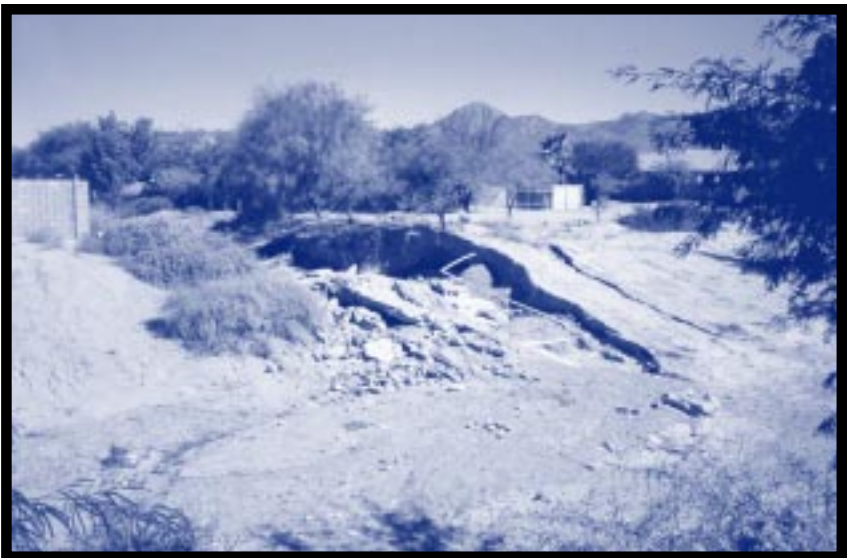
Severe erosion in an improperly lined channel.

Roofs can generate an enormous amount of runoff. When the runoff is concentrated onto small flat areas of the yard, where runoff cannot flow away from the house quickly enough, ponding or flooding of an entryway or back patio can occur. Possible solutions include grading, relandscaping, enlarging wall openings, and/or removing obstructions to flow. All of these are designed to allow water to flow away from the house as quickly as it is running off the roof. Installing rain gutters on key sections of the roof, to collect and convey runoff to a safe location, is another possible solution, and in some cases may be the only practical solution.