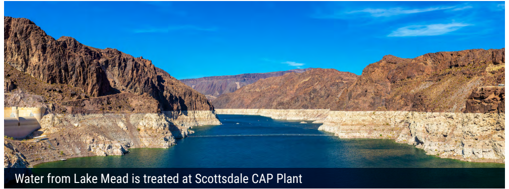
Water from Lake Mead is treated at Scottsdale CAP Plant

Depending on the time of year, the weather, and customer demand, you may receive water from a single source or from a combination of sources.